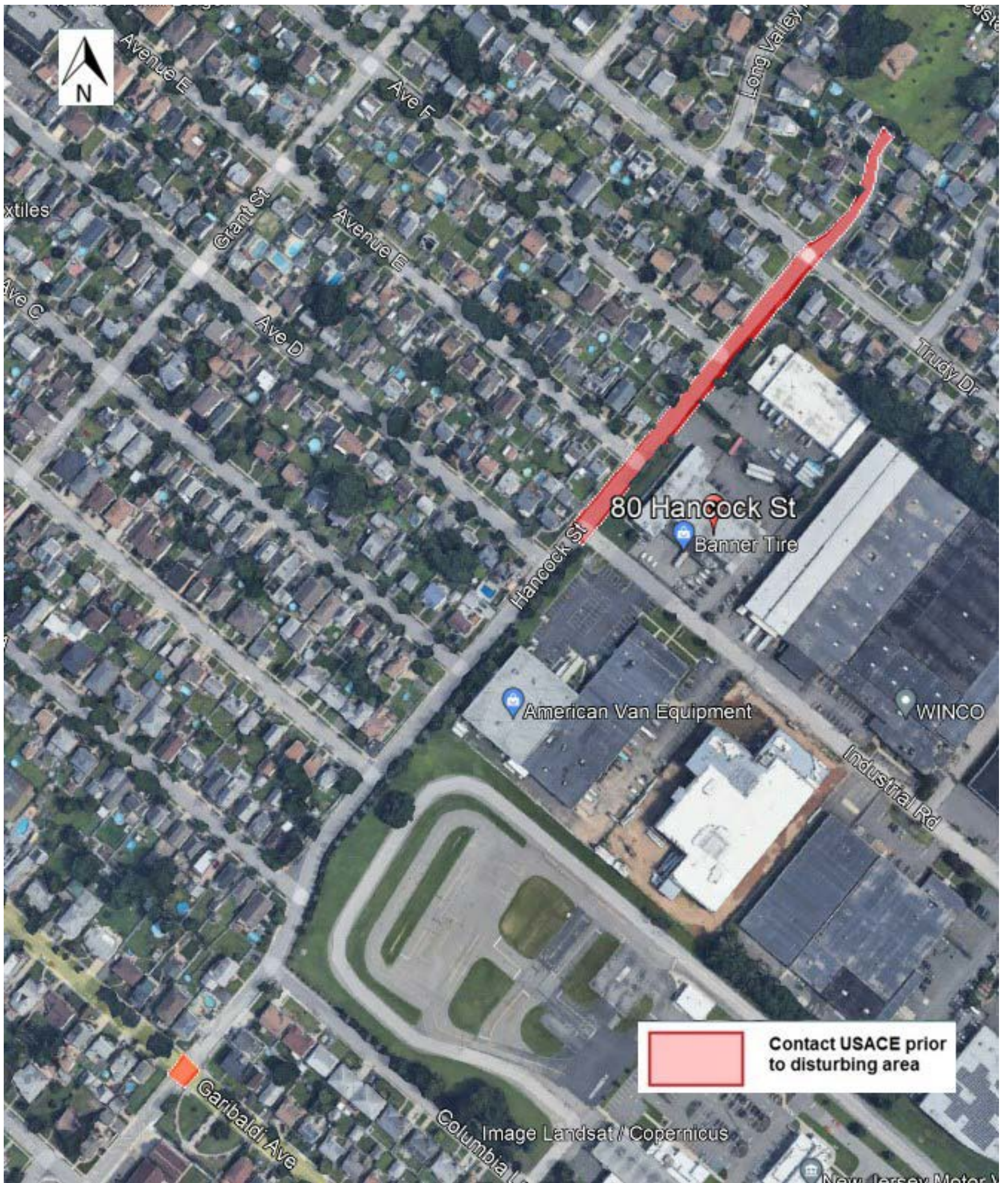
Figure 7 – Hancock Street North, Hancock Street/Brook Street