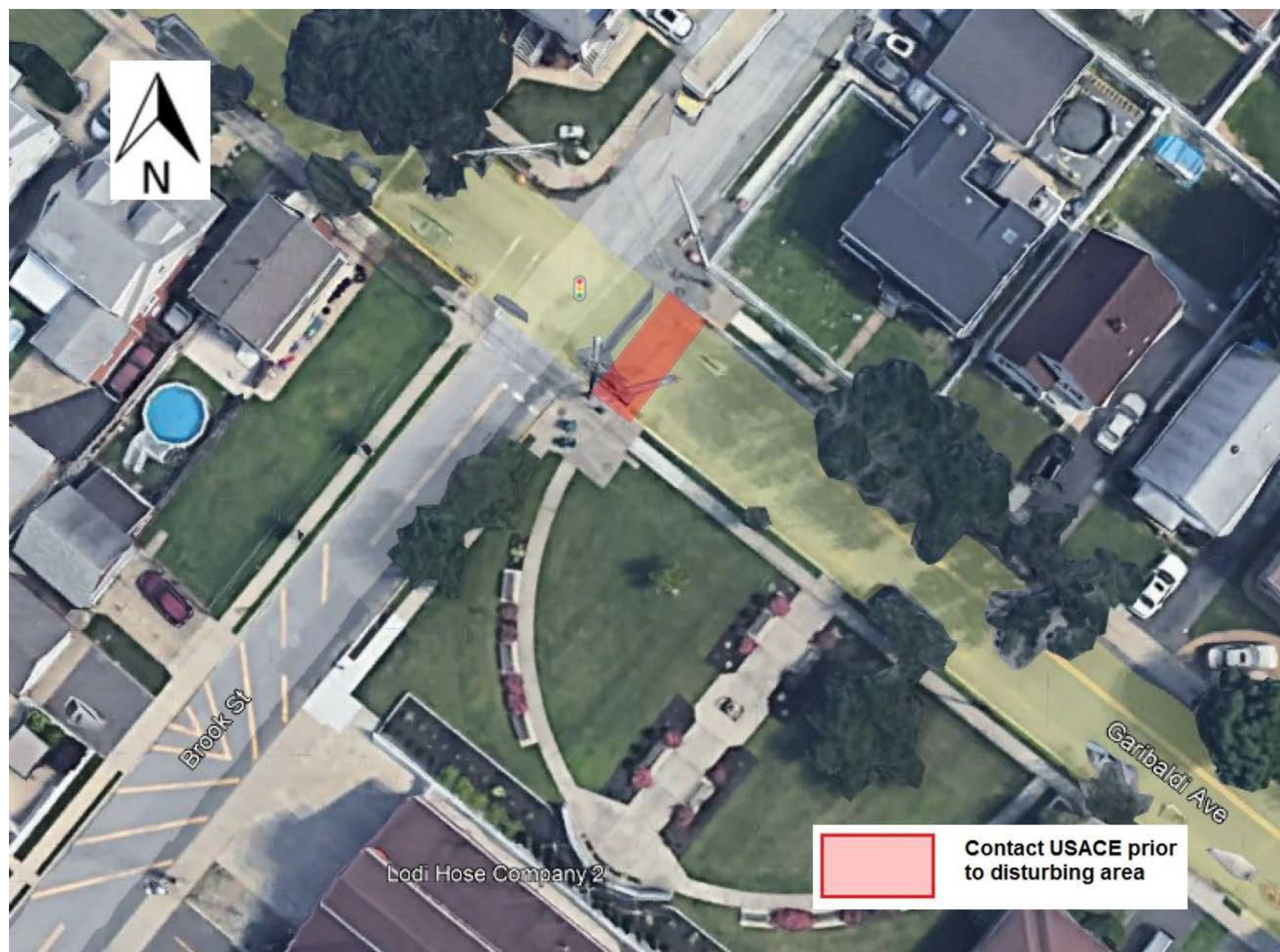
Figure 10 – Garibaldi Avenue