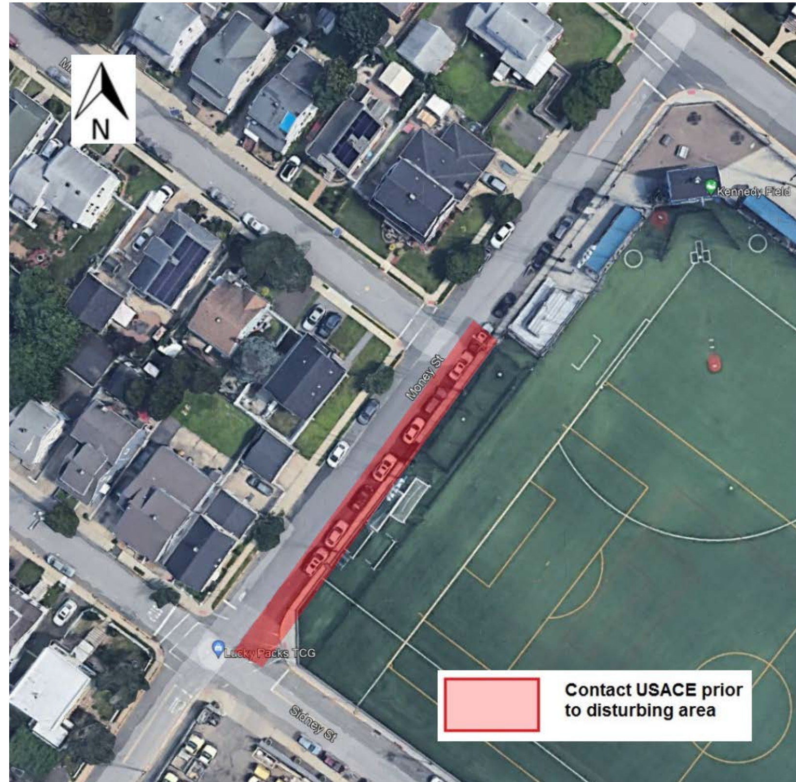
Figure 8 – Money Street