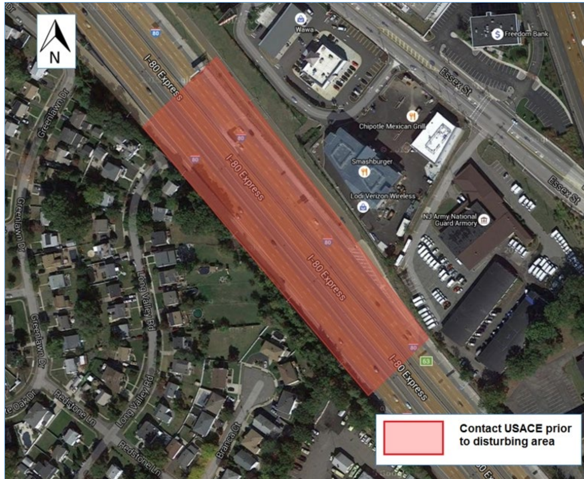
Figure 3 – Interstate 80