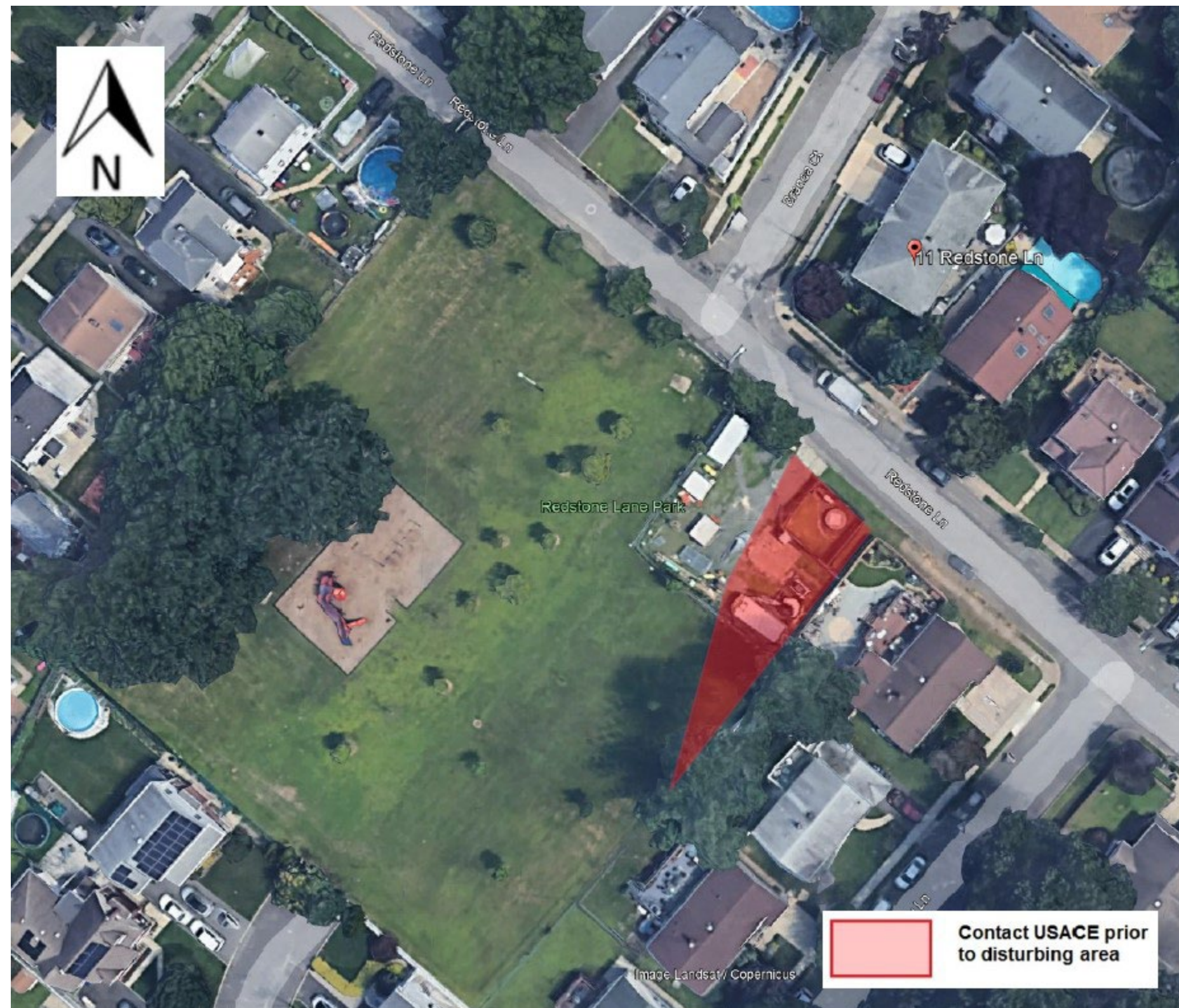
Figure 5 – Redstone Lane