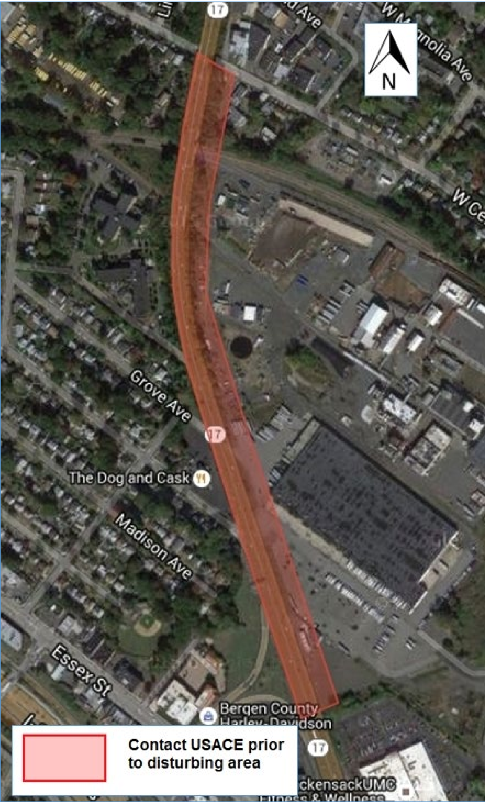
Figure 1 – New Jersey Route 17 and Williams-TransCo Natural Gas Pipeline